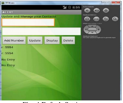
Fig. 4.Default Settings

When an emergency occurs the user need to press alert button once it send a message to trusted entities in the upper side a register button located were the functionality of register button is it allocate a new arrivals through contact are added by user in default way with the help of service providers get the location information. This button gets a SOS (Signal on one click) GPS.