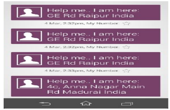
Fig.5. Trusted Person receive a message

Figure 5 illustrate that location co-ordinates information here GPS is used to getting the spatial location from that area to pass the sms.