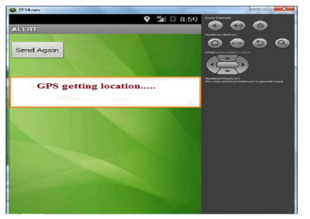
Fig. 5.Getting Location Co-ordinates

In figure 4 the default setting of numbers of trusted entities is added by clicking a add number a number is added from contact choose by user, Update is used to update any number to existing contact. Display work is to display the previous added contacts, Delete is to remove a record.