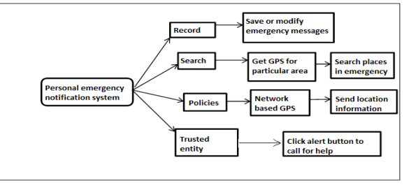
Fig. 1. Functions of emergency system

The functions of application include Record, Search, Locate, and Emergency Contact [3] as shown in figure1. In Record function, one can save or modify information about emergency corresponding people and default short messages. In search function, it is used to search a nearby police office and send a location image in a single click on button. In Position function it provides a location via getting a signal from GPS or networks here user can send short or default messages which or default in settings with the location information. In this emergency alert system user click photo button to send a alert message to trusted persons or an police office department.