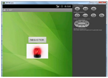
Fig. 3. Panic SOS Button

When an emergency occurs the user need to press alert button once it send a message to trusted entities in the upper side a register button located were the functionality of register button is it allocate a new arrivals through contact are added by user in default way with the help of service providers get the location information. This button gets a SOS (Signal on one click) GPS.